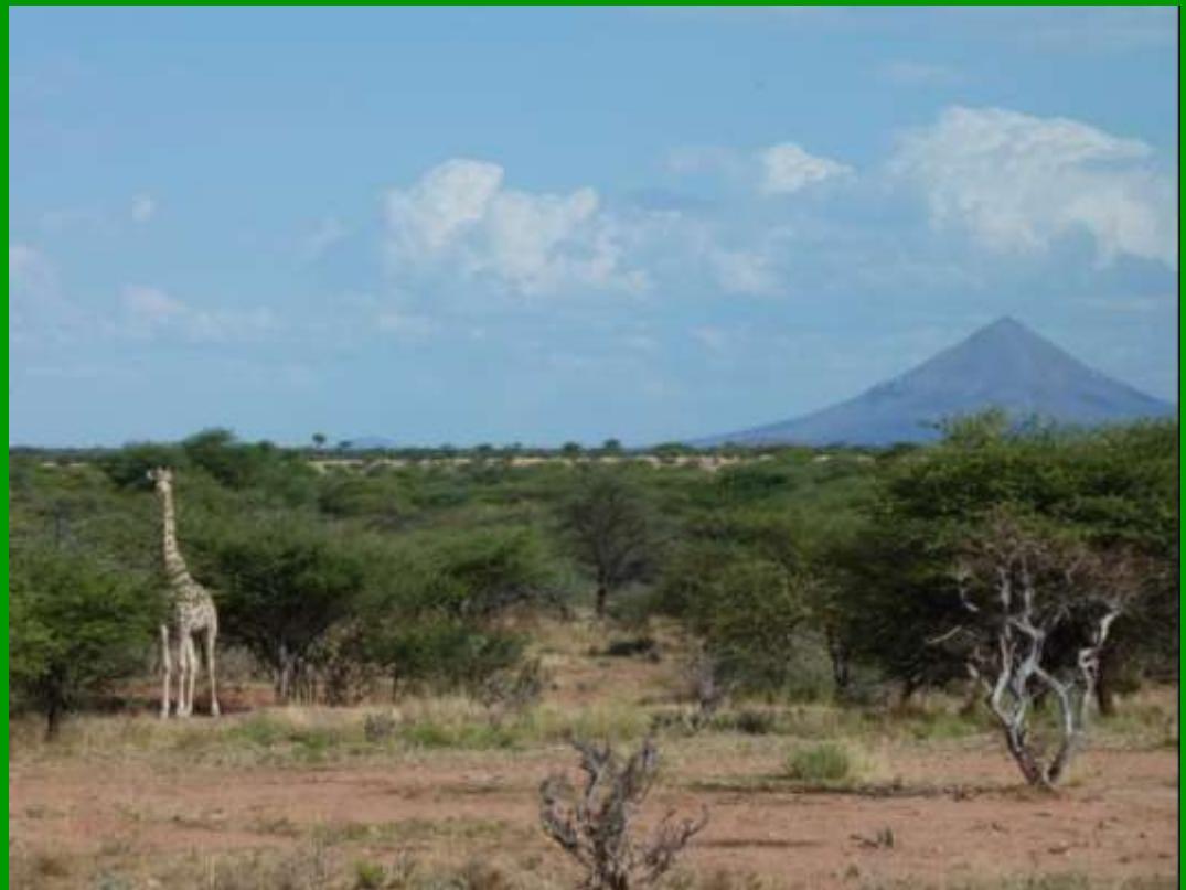
Omatako Mountain, Namibia